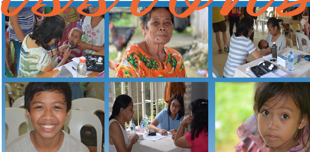
Above: Medical missions in various locations throughout Leyte.

This year, the team conducted medical missions in four places: Quarry, Tigbawan, Babatngon and Wangag. They saw 900 patients in 4 1/2 days. They also held a three-day youth rally in two different places: Quarry and Wangag, Albueria with all expenses subsidized by River TEC. About 350 young people attended.