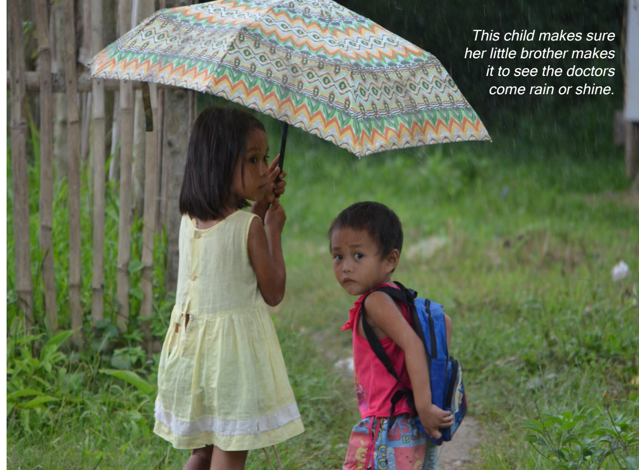
This child makes sure her little brother makes it to see the doctors come rain or shine.

Part of our vision was to render medical missions to areas that have never been visited by medical providers and have no access to a doctor, clinic, hospital or medicines. Since 2008, the Lord has been providing for us financially to enable the missions teams to provide medical care and medicines to several places.